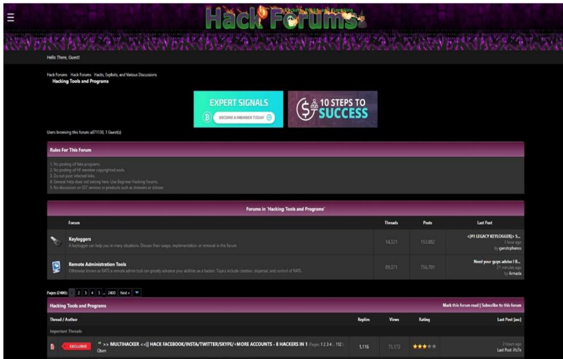
Figure 1. Forums (hackforums.net)

2. Fan pages are categorized, like forums, as places where users can post topics of conversations for others to post replies. Fan pages can be created by any individual. These pages are then hosted on a larger website alongside other fan pages of varied interests. For instance, there can be one fan page created about dogs and another fan page about hacking all on the same website. Fan page websites have their own administrators and moderators that can control any fan page. Individual fan pages can then have their own set of administrators and moderators. Finally, users of these larger sites can visit these fan pages and post onto them once they become members of that community. There are some fan pages that make entry into their community restricted. What this means is if an individual wants to read the fan page one of those fan page's that are